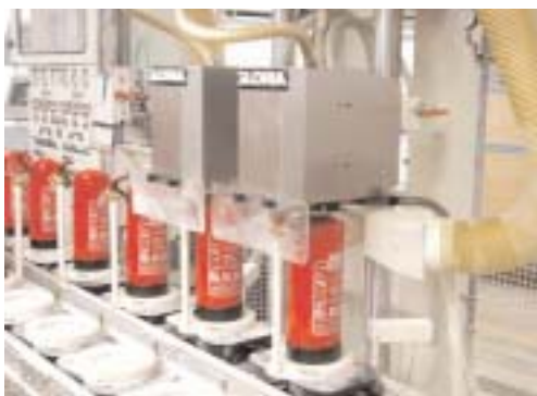
The manufacturing facility of Gloria in Germany, now part of the Kidde group following the acquisition on 22 March, 2004.

Further information is available on www.kidde.com