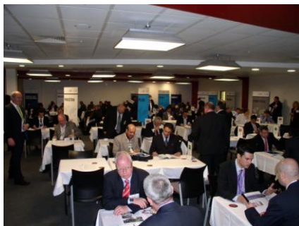
The Meet The Buyers event at IFSEC 2010

FIRESA now works with FIA Export and has forged a direct link with UKTI's Defence and Security Organisation. A number of specific export tenders are made known to members and there are opportunities for our many SMEs to apply for TAPS funding for exhibitions which included Interschutz that took place earlier this year. Participation in trade missions is possible via FIA Export which has organised recent fire-specific missions to Thailand and Vietnam and which has India, Argentina and Brazil coming up in the next six months. These represent cost-effective means of getting the very best out of overseas market visits as working with Embassies' Commercial Officers in the territory results in a programme of seminars, receptions and customer contacts that individual visitors would be hard pressed to achieve on their own.